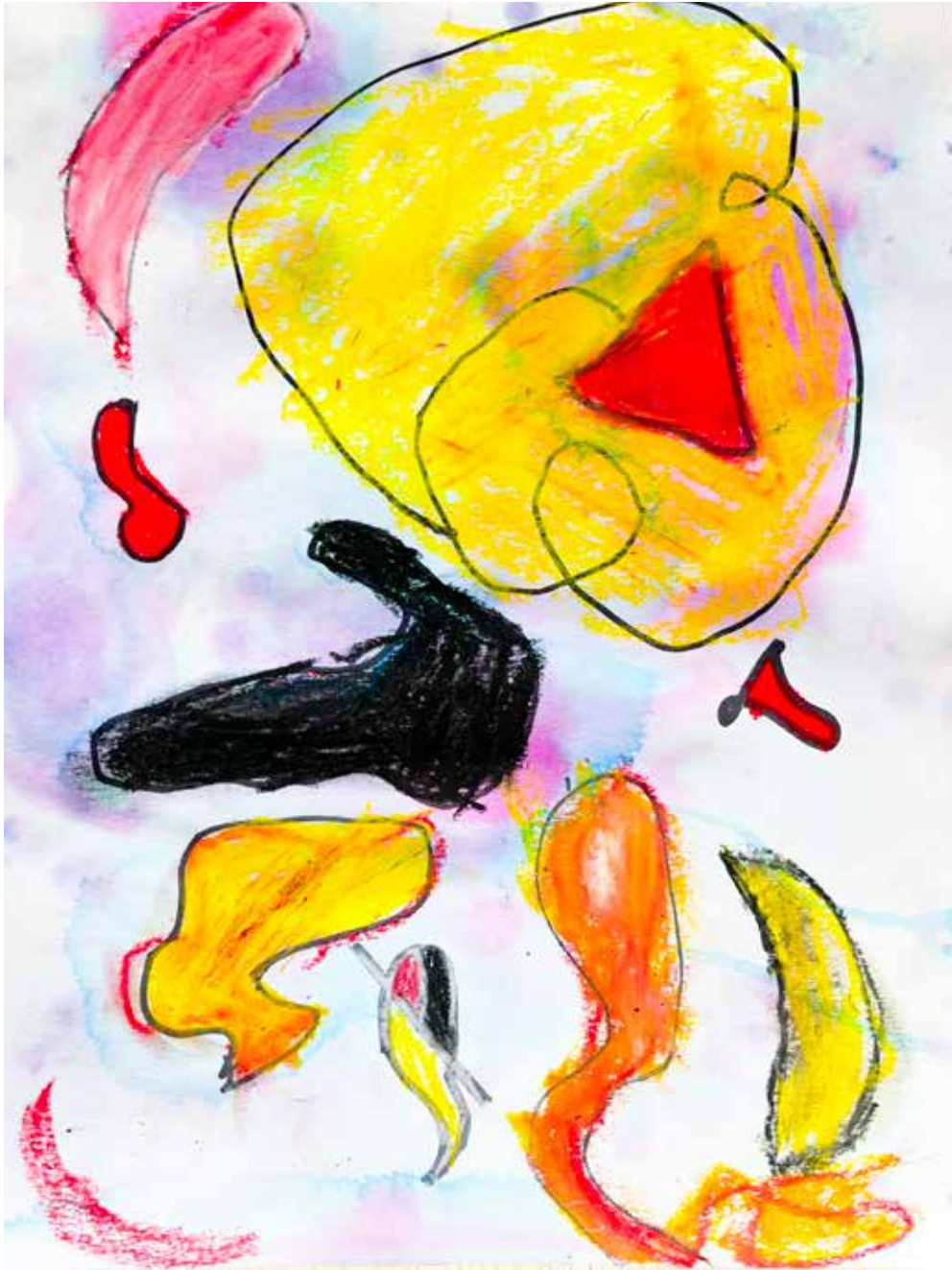
Inspired by Joan Miro, the art club

The art room presents playful times in the golden glow of autumn.