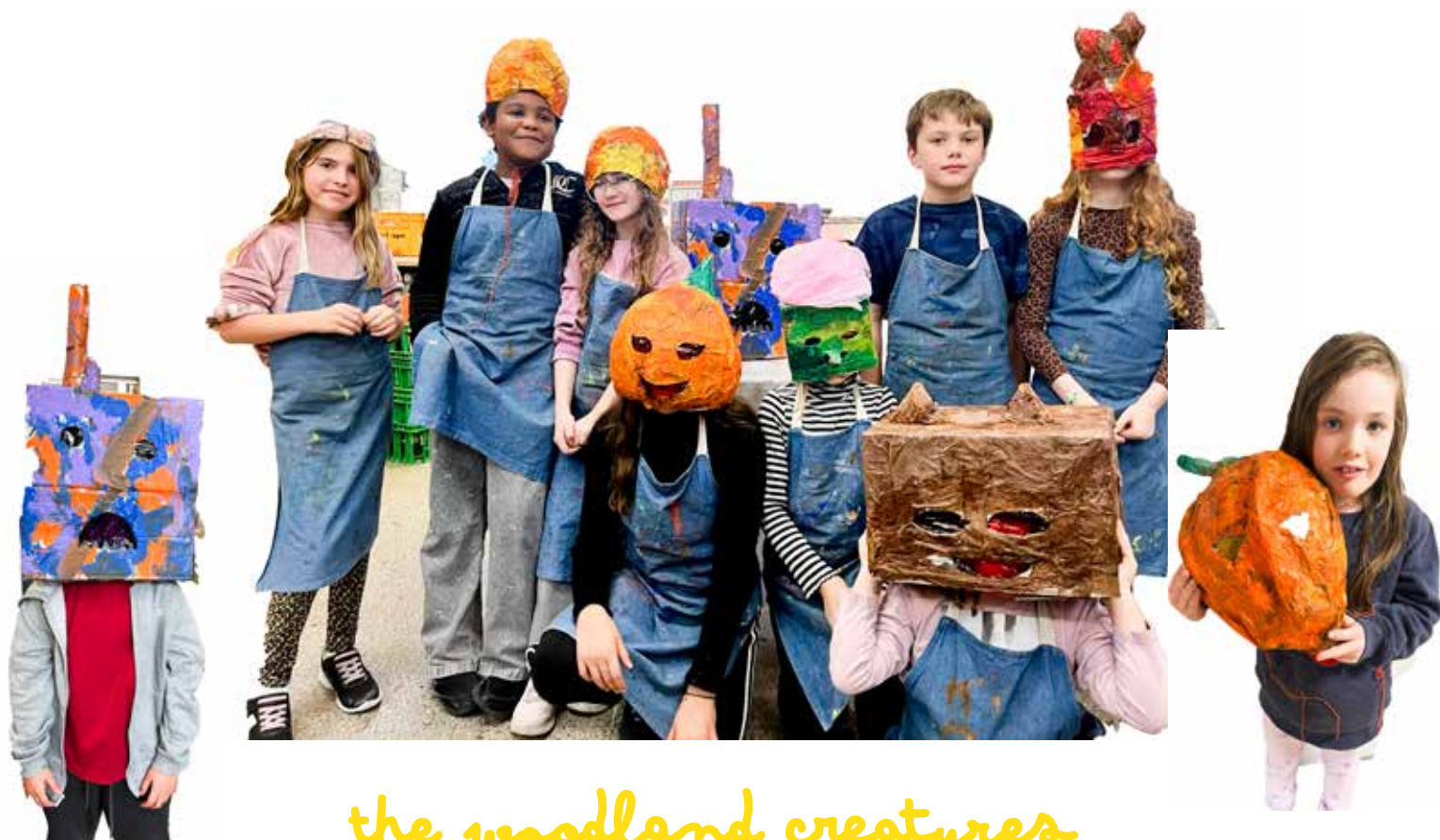
the woodland creatures