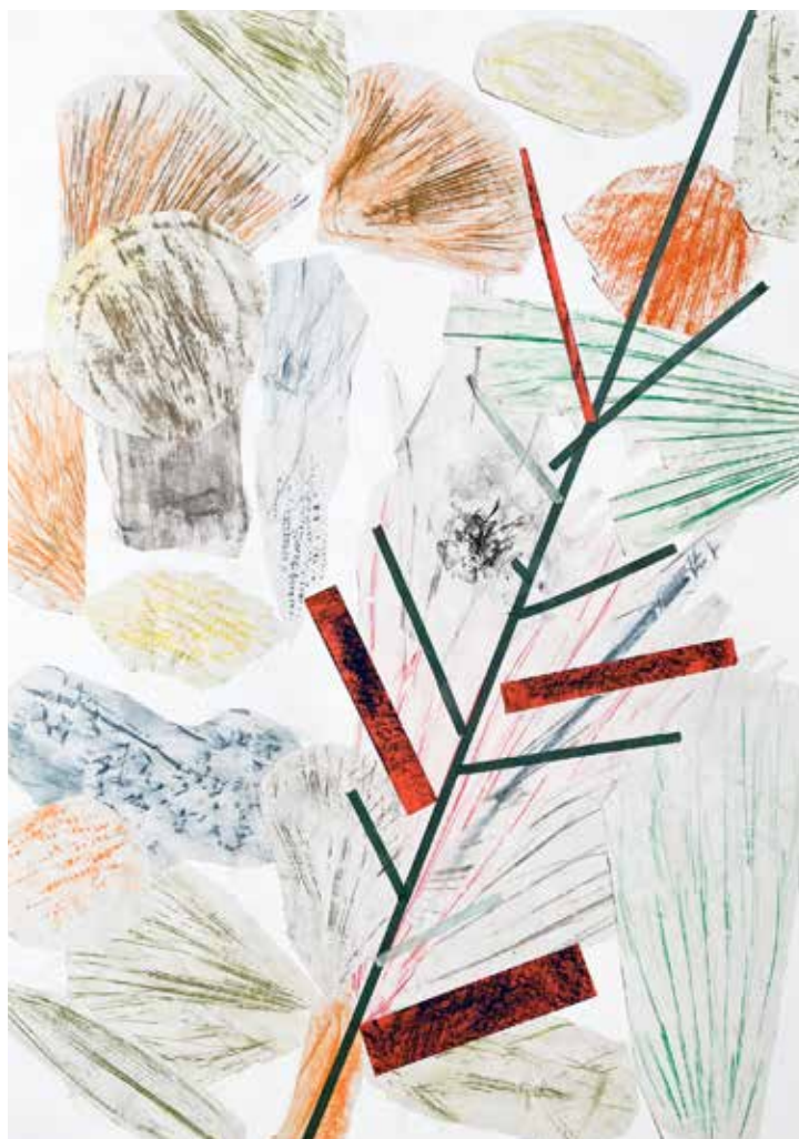
The leaf - Year 4/5- Nature programme

We are thrilled to share with the generous support of the TEXEL Foundation, the art room at Highgate Primary School have launched four exciting new programmes this term: